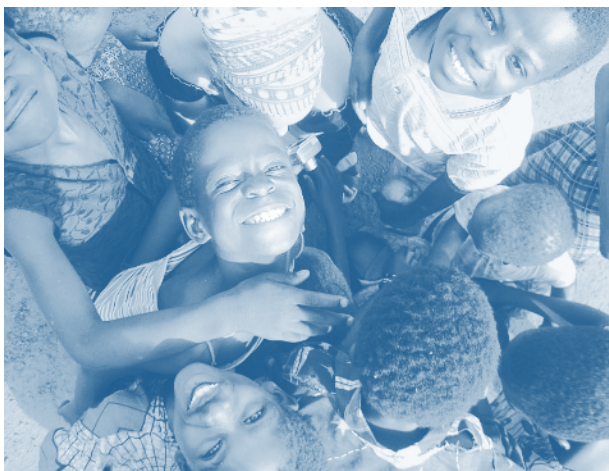
Children outside the Baptist Medical Center in Nalerigu, Northern Ghana.