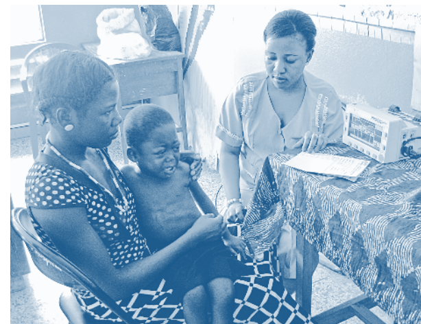
A mother with a sick child talks to a triage nurse at Ola During Children's Hospital in Sierra Leone.