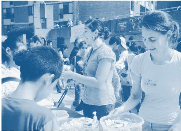
Boston Chinatown Neighborhood Center's Oak Street Fair: Fellows organized five stations related to health and nutrition, including blood pressure and oral health screenings.