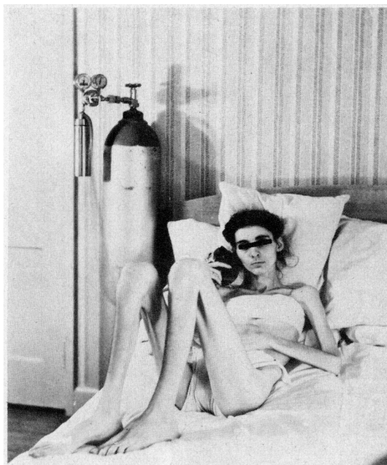
Figure 4. Appearance of a Patient with "Salem Sarcoid" (Beryllium Disease)

laws. A hardship for the sick worker is the fact that all third-party medical insurers, including Blue Cross/Blue Shield, will pay nothing when a worker's compensation claim is pending; nor will a hospital admit such a worker without a letter from an insurer willing to accept the cost (several of my patients have suffered delays of as long as 15 years). The economic rewards if the worker does win his claim are in most cases pitifully little; compensation benefits have been successfully kept low by insurance and employer lobbies. 1