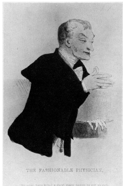
Figure 5. Nineteenth-Century "Fashionable Physician."