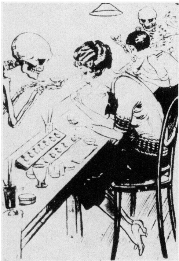
Figure 3. Death and the Girls Who Tipped Their Lips with Radium-Solution-Filled Brushes (Reproduced from Hunter 2 with the Permission of the Publisher).

Few practitioners know that they must tell the patient, as soon as it is certain, that his illness is occupational. Next, they must instruct the patient to write at once to the company (keeping a copy) reporting his illness. If he does not do so, the company may be able to avoid liability. Few doctors realize how little money support present compensation laws give the sick worker, 1 but of importance is the fact that in some states, including Massachusetts, the law does require the insurer to pay medical costs. The patient must pick his lawyer, who is paid nothing unless the patient wins. The company's lawyers, paid no matter what the decision, take refuge in delay and adversary-questioning technics, which successfully drive doctors from wanting to participate. Appointments to the Industrial Accident Board are made by the Governor, without required professional background, and its members may operate without trained advice unless they choose to engage a consultant or ask other agencies of the Department of Labor who are studying and controlling worker risk under state