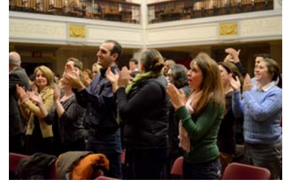
Over 50 family members, friends, and teachers came to cheer on the students at their final performance