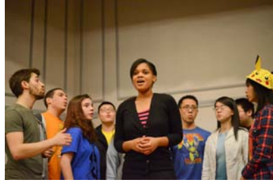
Students performing at their final show in March