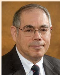
HENRY L. DORKIN, MD, FAAP Award for Distinguished Service to the MMS