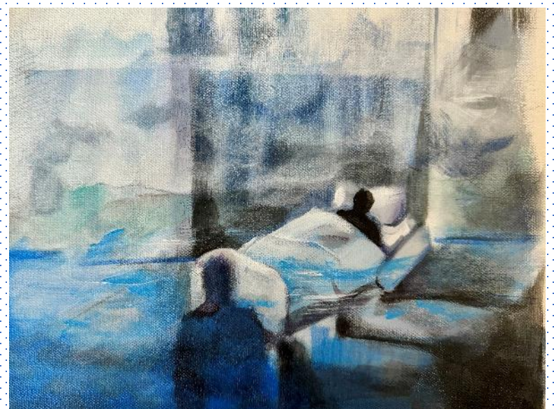
15 - Floating Away Artist: Danielle Li Worcester Medical Student Medium: Acrylic on Canvas