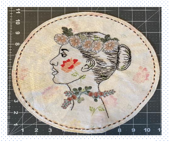
27 - Island Girl